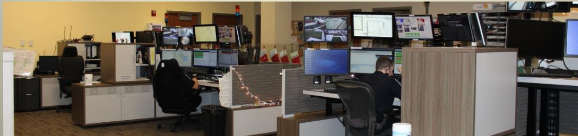
Glenview Dispatch Center